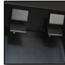
Double top lock