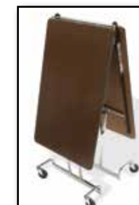
Dun12 (Chrome leg)