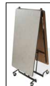
WO-10 (Black powder coat)