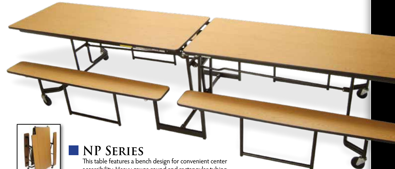
Tamper resistant storage lock.