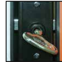
Keyed post lock