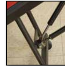
Hydraulic lift assist