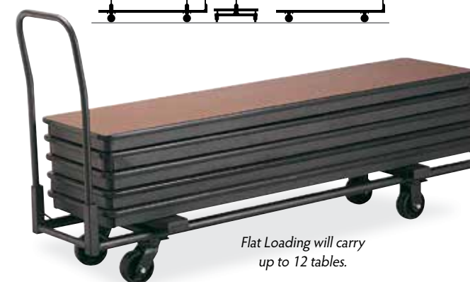
Flat Loading will carry up to 12 tables.