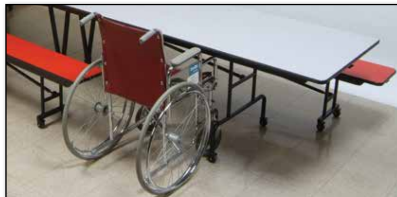
Wheel chair accesability available

Optional bench and table heights allow you to provide wheel chair accessibility throughout your cafeteria or multi-purpose room. Tables can be stored in any cabinet pocket of the same length or width allowing you to change the table and bench set ups to meet the needs of each event.