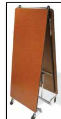
Dun12 (Chrome leg)