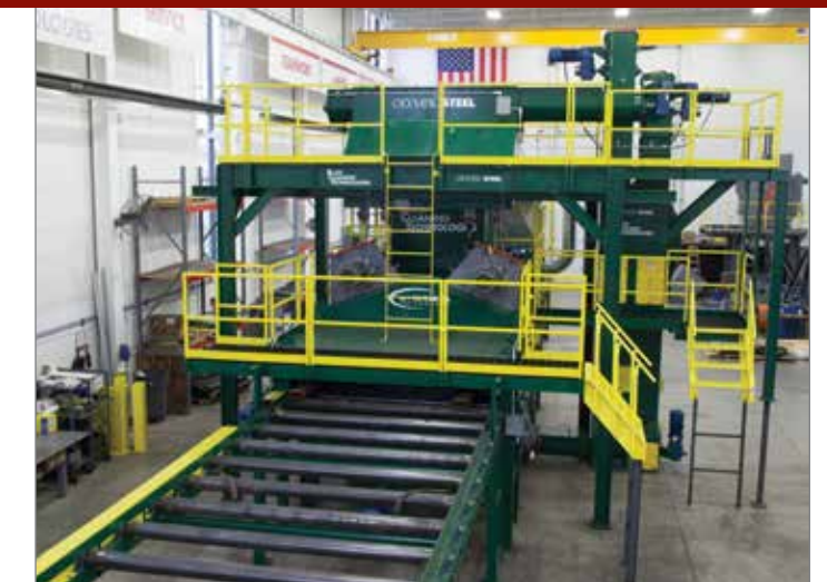
PLATE / STRUCTURAL

BCT offers roll conveyor systems from 4' wide to 13' wide to handle everything from plate stock to 15' tall bridge girders.